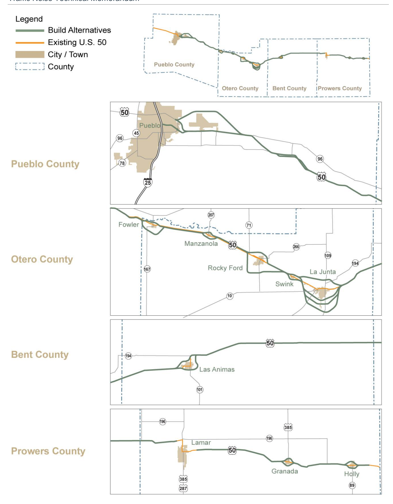
Figure 6-1. Build Alternatives Overview