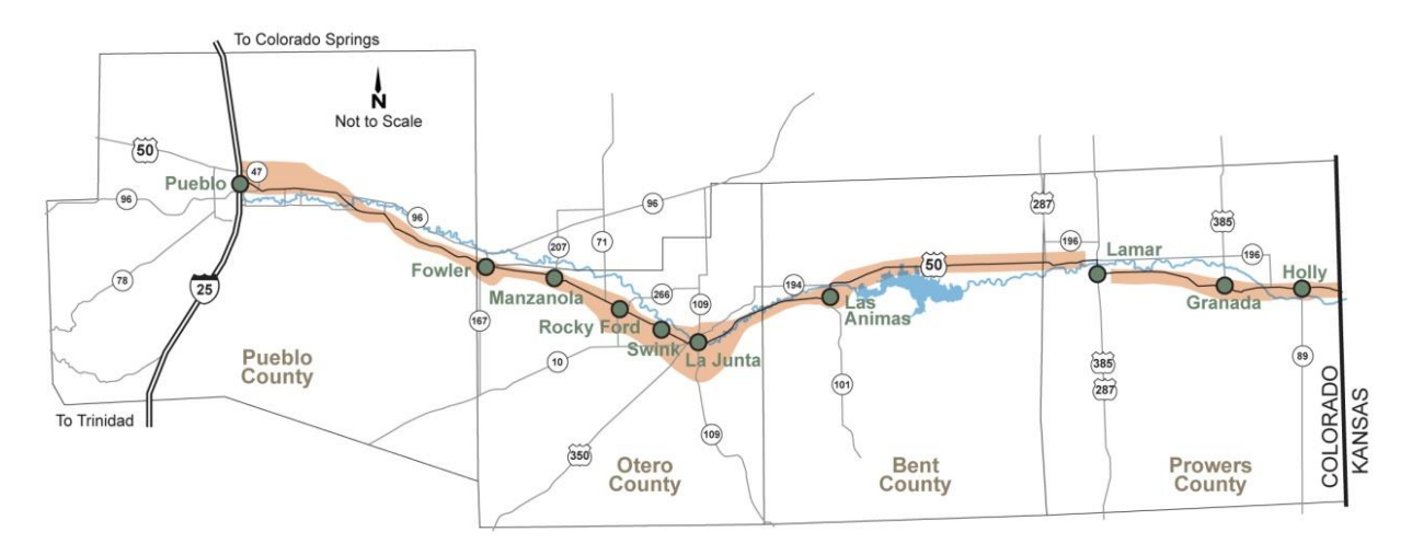
Figure 1-1. US 50 Tier 1 EIS Project Area

The project area does not include the city of Lamar. A separate Environmental Assessment (EA), the US 287 at Lamar Reliever Route Environmental Assessment, includes both US 50 and U.S. Highway 287 (US 287) in its project area, since they share the same alignment. The Finding of No Significant Impact (FONSI) for the project was signed November 10, 2014. The EA/FONSI identified a proposed action that bypasses the city of Lamar to the east. The proposed action of the US 287 at Lamar Reliever Route Environmental Assessment begins at the southern end of US 287 near County Road (CR) C-C and extends nine miles to State Highway (SH) 196. Therefore, alternatives at Lamar are not considered in this US 50 Tier 1 EIS.